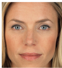
AFTER 2.5 SYRINGES